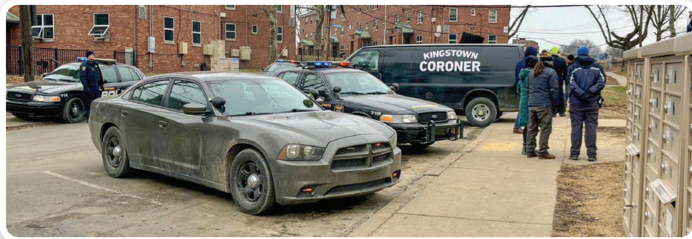
The production companies of Paramount Plus' 'Mayor of Kingstown' series have contributed roughly $100,000 to the Clean Slate Scholarship Program since they began filming at HACP properties during season 2.

For more information on the Clean Slate Scholarship Program, please visit: https://hacp.org/programs-services/scholarship-fund .