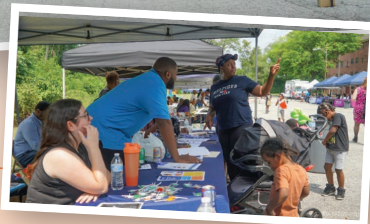
The HACP ROSS team held a number of Community Health Awareness Days at our properties, including Arlington Heights, in the summer of 2024. Pictured are ROSS staff connecting with residents, and residents enjoying the fun activities surrounding the event. Please see page 12 for this year's Community Health Awareness Days schedule.