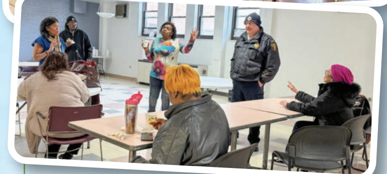
The HACP Public Safety staff collaborates with the Pittsburgh Bureau of Police to offer 'Coffee With Cops' sessions to our high rise residents in an effort to increase communication on public safety. Pictured is a recent session at PA Bidwell on the Northside.