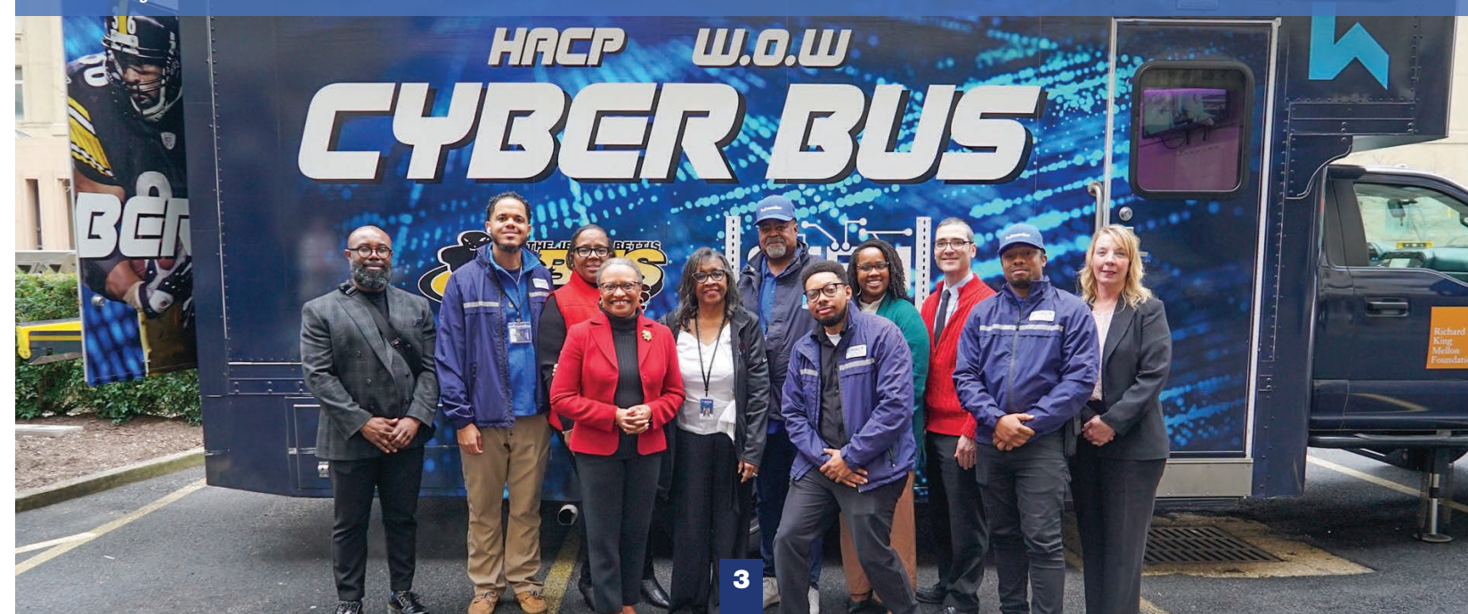
The HACP Digital Literacy Initiatives team poses with former HUD Secretary, the Honorable Adrienne Todman, outside of the WiFi On Wheels CyberBus in Washington, D.C., during the ConnectHomeUSA Summit in December.

For more information on the HACP’s Digital Literacy Initiatives, please visit: https://hacp.org/programs-services/digital-literacy-initiatives .