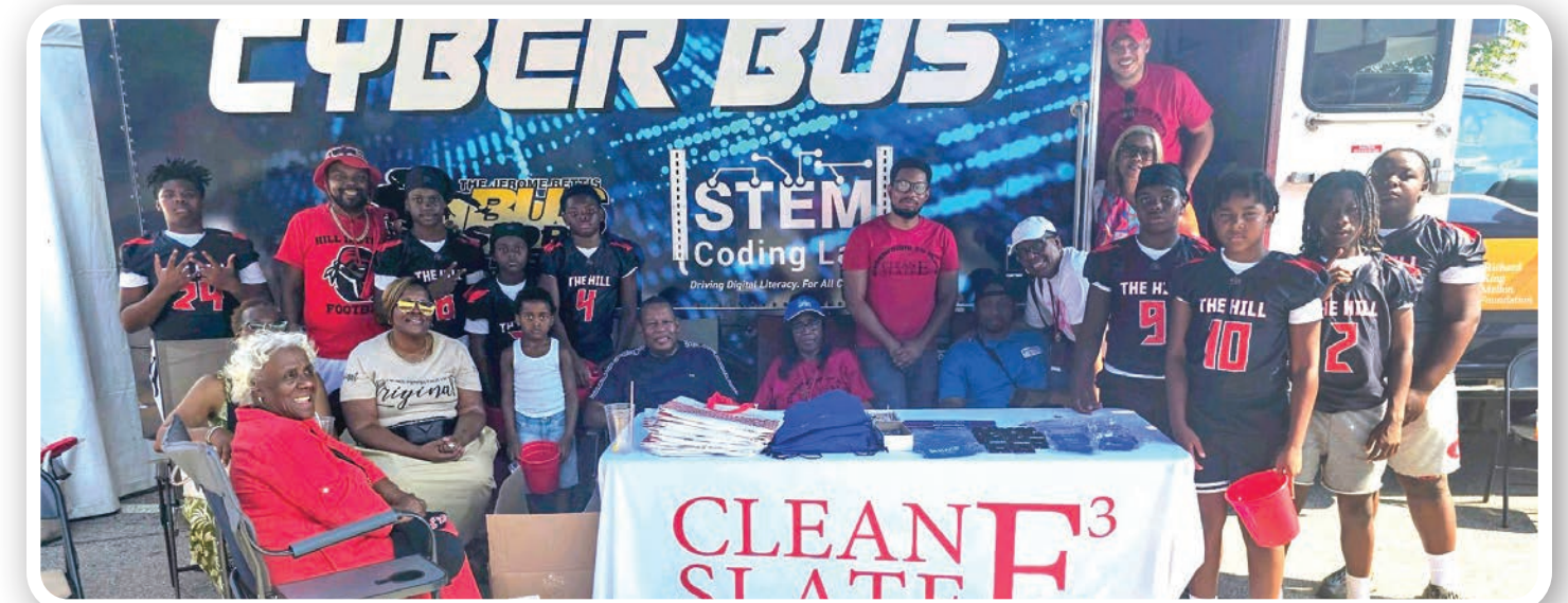
HACP staff pose with Hill District Rebels players during the ACH Pathways Hill District Arts Festival in July 2024. Clean Slate was a presenting sponsor of the arts festival in celebration of Clean Slate's 25th anniversary.