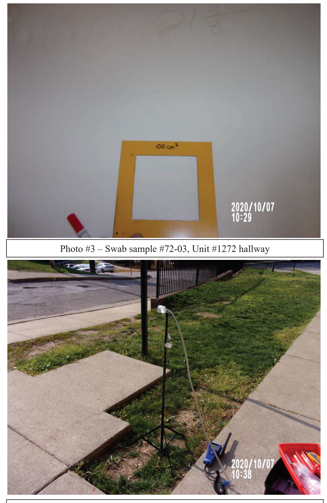
Photo #4 – Spore trap air sample #Ext-01, Outdoors near Unit #1272