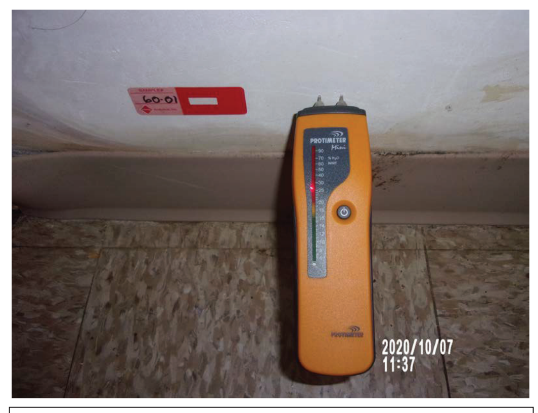
Photo #25 - Moisture meter at red level reading, Unit #1260 living room