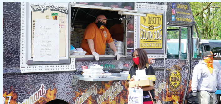
South Side BBQ brought their food truck to Bedford Dwellings and provided residents with some freshly made meals.

The South Side BBQ food trucks were the center of the event, but they weren't the only thing going on that day. 412 Food Rescue and the Greater Pittsburgh Community Food Bank both attended and also distributed food, making sure that families have access to fresh produce or other food items they need.