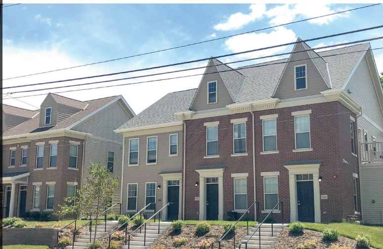
The newly constructed Kelly Hamilton Homes line Kelly Street and Hamilton Avenue.

Looking to the future, HACP will continue to work with our development and community partners to further our development goals and offer Pittsburgh residents the best housing experience we can.