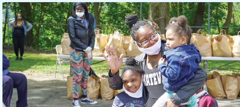
The BGCWPA food truck event was a community day of sorts, bringing residents together and smiles to their faces.