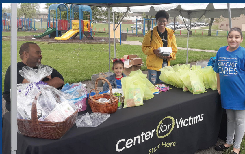
The Center for Victims staff has a number of resources available to HACP residents.

The COVID-19 pandemic has impacted many people's lives in wide-reaching ways. Stress and trauma impact our lives in various ways; they can make it difficult to think or feel, disrupt personal relationships, or many other things. The Center for Victims, one of HACP's trusted service partners, is a resource for any resident who may be struggling during these times.