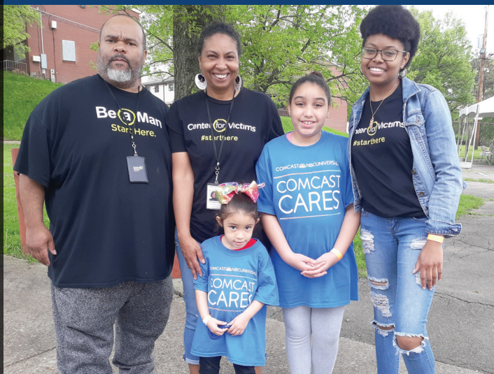
HACP residents can rely on the support and services that the Center for Victims provides.