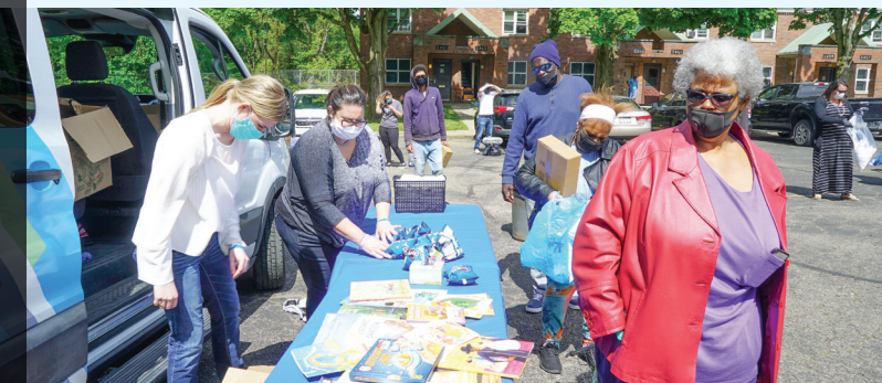
Service providers handed out resources related to health, education, and safety to residents.

Beyond the food and the resources, though, this food truck event brought people together and gave them the opportunity to see each other in a way they hadn't in months. Neighbors and friends saw each other's faces again, though they were mask-clad. They talked and laughed together again, though they were six feet apart. It may not have been a community day, but the sense of community was uplifting.